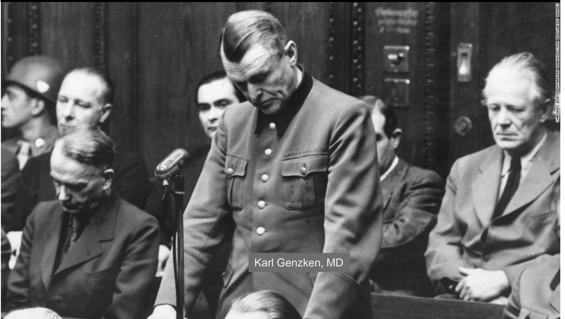
Karl Genzken, MD

"Remembering the 70th Anniversary of the Nuremberg Doctors' Trial: Lessons and Legacies for Health and Society"