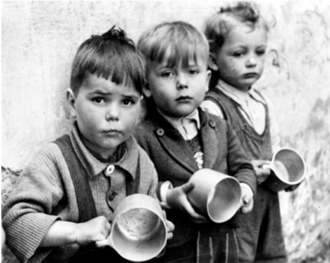
Starving children in Europe before the Marshall Plan. Photos such as this sparked sympathy in the American people and gave Truman leverage to pass his Plan.

(Unknown Photographer), "Starving Children," ca. 1949, Harry S. Truman Library and Museum.