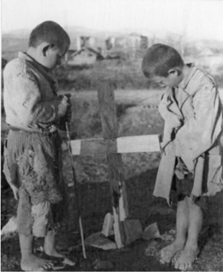
Greek orphans before the Marshall Plan. Poverty was rampant in war-ravaged Europe.

(Unknown Photographer) "Orphaned Children in Greece," ca. 1947, Harry S. Truman Library and Museum.