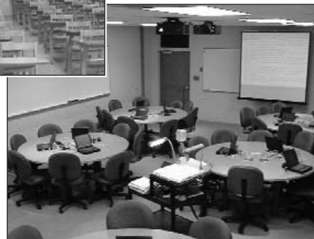
A physics classroom at North Carolina State University arranged for traditional lectures (inset) and redesigned for group problem-solving in the SCALE-UP program.

jors and nonmajors, and outcome assessments indicate high content retention and student satisfaction (8).