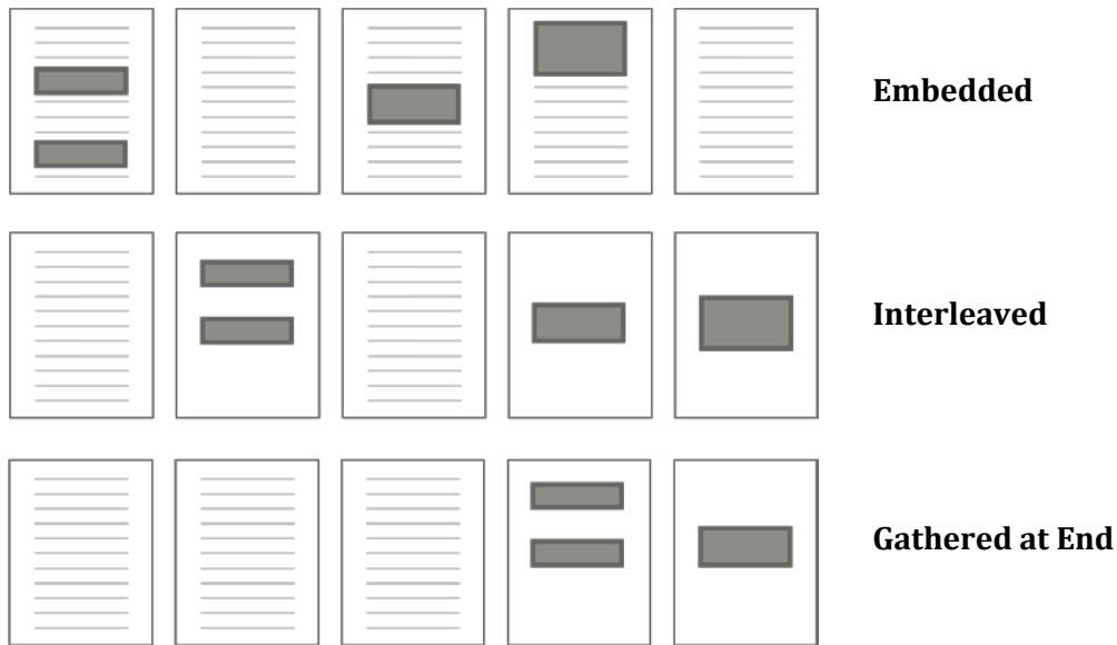
Figure 1. Three options for figure/table placement. This figure depicts the three acceptable options for placing tables and figures in your thesis. Choose one option and use it consistently throughout.