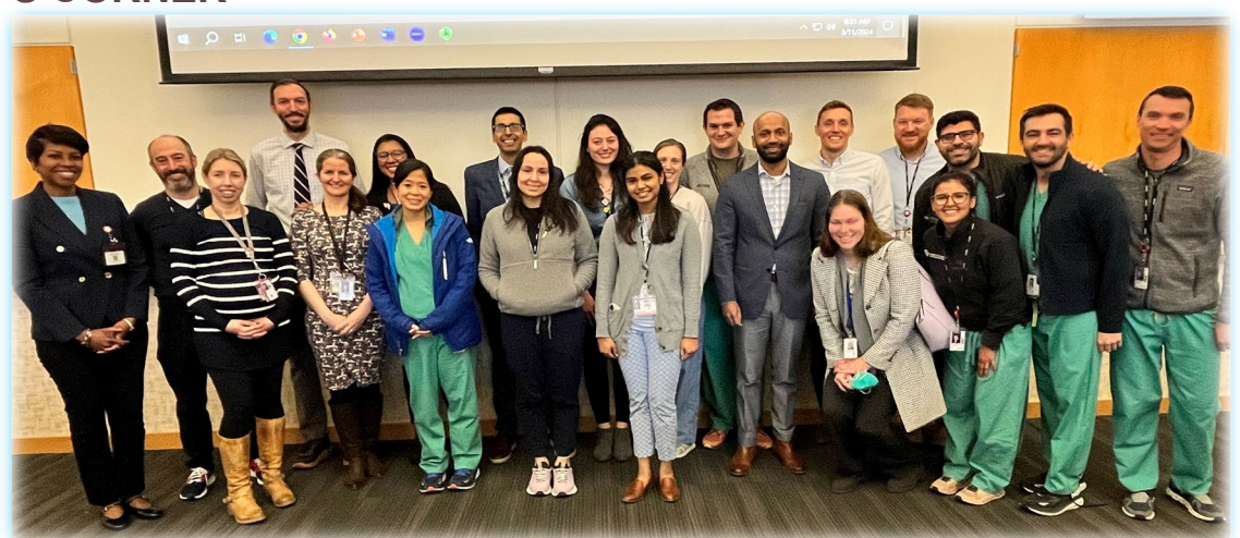
Fellows wear blue to raise awareness for Colon Cancer on Monday March 11, 2024