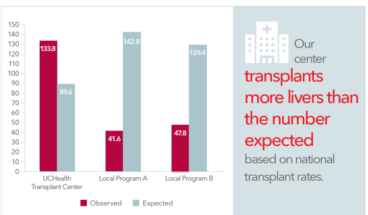
Graph compiled from optn.transplant.hrsa.gov 1.9.2024

* Observed and expected liver transplant rates. 7.1.2021-6.30.2023