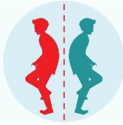
Avoid contact with others