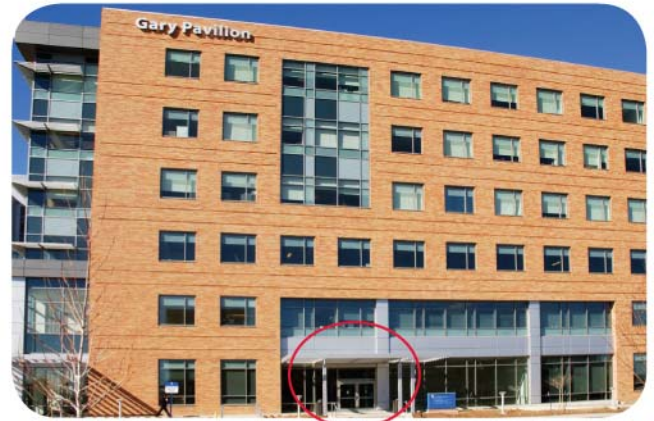
Gary Pavilion entrance

From HWY 36, follow signs to I-270 then to I-70 E. Merge onto I-225 S toward Colorado Springs/Aurora. Take the Colfax Ave exit, Exit 10. Turn right onto E. Colfax Ave. The hospital is on the north side of Colfax. Turn north on Victor Street. Go through the stop sign. The Gary Pavilion is on the west side of the street. Parking is available in Lot 10 on the east side of the street.