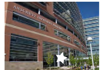
The east entrance to the Conference Center is marked by the white star.