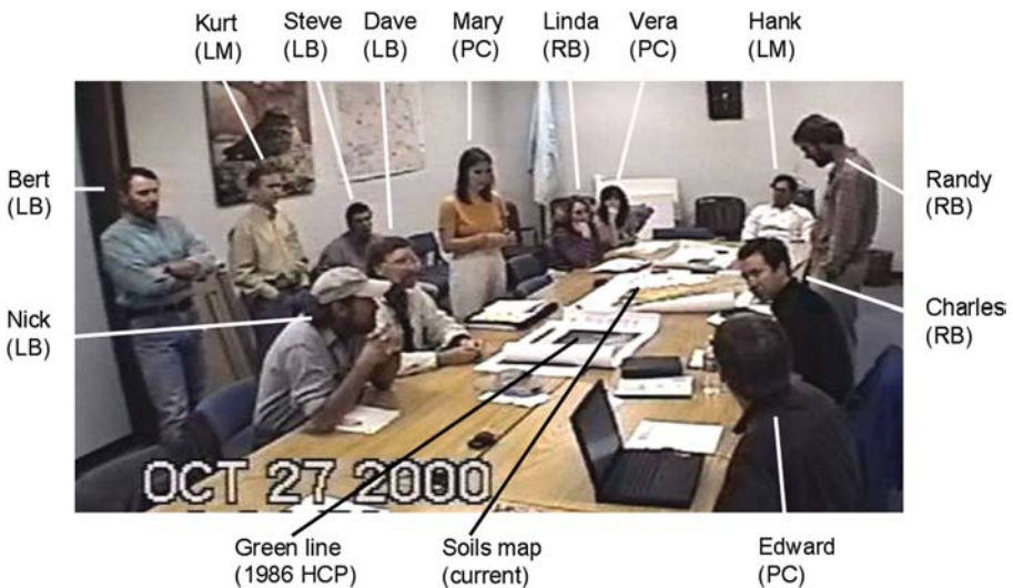
Figure 5. Seating order, participants and active map documents in SAC meeting to discuss conservation plan for an endangered lizard species in the valley. Different professional roles include plan consultants, regulatory biologists, local biologists, and land managers.

DAVE (LB): The hot red? Um, well, these are reflectance values that the computer sees from um, an Ekinos satellite image that’s forming a resolution using color, three color infrared . . . um scanning and it APPEARS based on my field checking and experience out there, that the RED areas are the areas with the most active and um LEAST compacted sand. And in areas within the