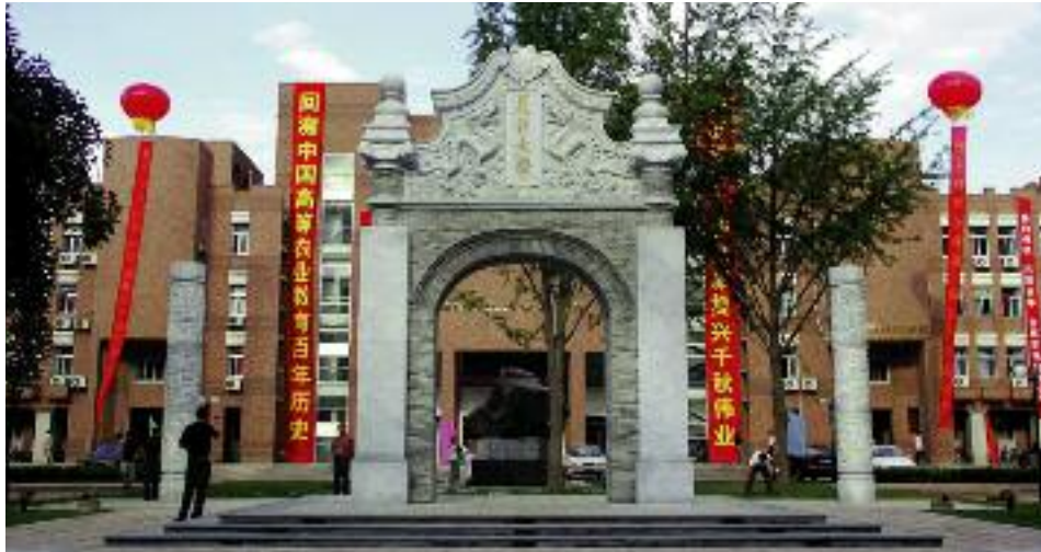
UC Denver has a partnership with China Agricultural University in Beijing, China (above). We are exploring additional collaborations in Saudi Arabia (below).