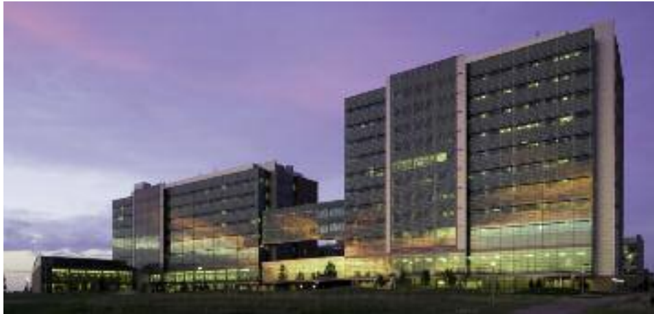
Anschutz Medical Campus