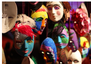
Masks painted by survivors, advocates, and friends hung in a gorgeous display at the Wells Fargo Theater